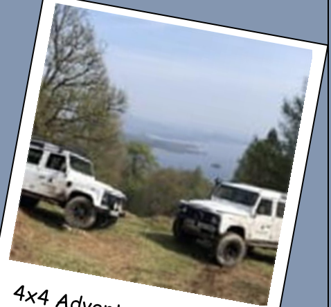
4x4 Adventures Scotland

Get the heart race pulsing with some tube races and fun games on the water. If you're really brave, try your hand at cliff jumping too! Hilarity and wonderful memories guaranteed! All provided by In Your Element , click here to find out more.