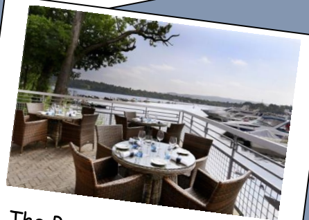
The Boat House Restaurant