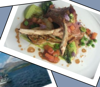
Sweeney's Cruise Co.