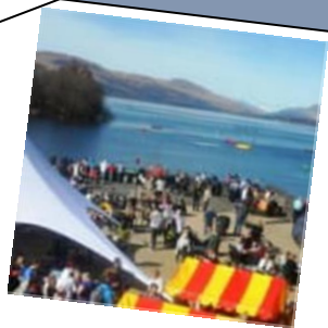
Loch Lomond Shores