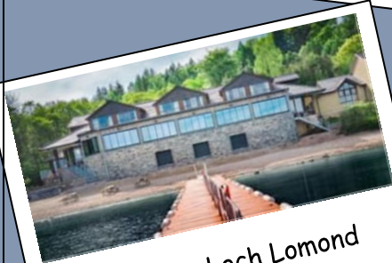
Lodge on Loch Lomond