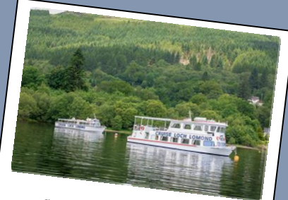
Cruise Loch Lomond