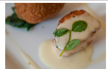
Eat out in Loch Lomond

Why not extend your visit and stay for a short break – visit Places to Stay for lots of inspiration.