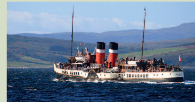
PS Waverley , the world's last seagoing paddle steamer