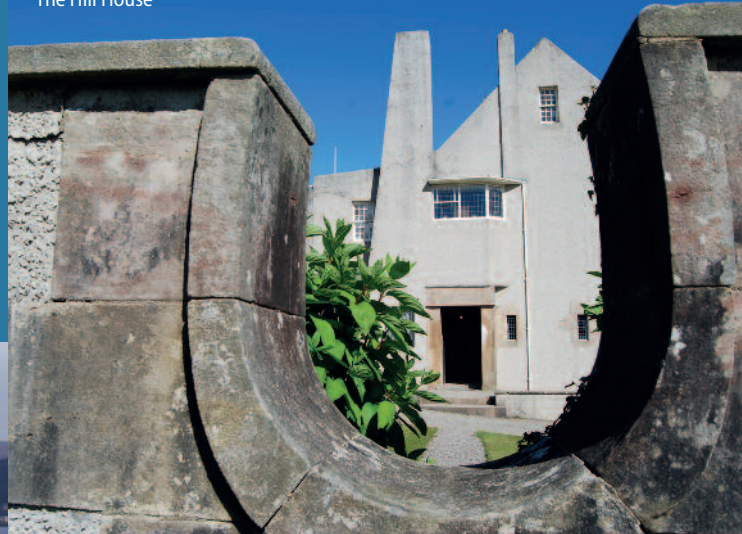
The Hill House